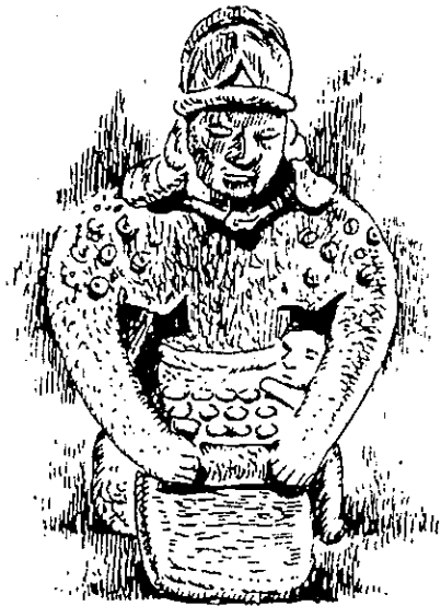
Colima 100-500 A.D.

CHICKEN RANCHERO simmered in rich ranchera sauce__13.49 STEAK RANCHERO__14.49