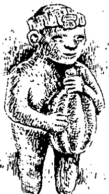
Vera Cruz 14th Century Stone figure holding a squash

FISH SALAD sauteed fish with mixed greens and a spicy dressing__11.99